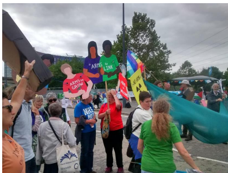
WILPF women at the anti-nuke environment day at the DSEI

A vigil for Armed Forces Day saw us in the rain holding the Guernica banner with friends from several organisations and handing out leaflets. This also marked the end of Refugee Week and once again followed a tragic bombing prompting people to respond with sadness.