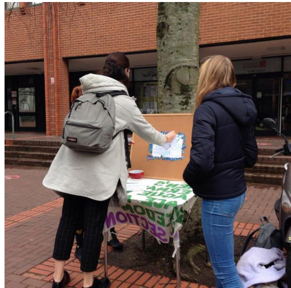
WILPF activists at University of Bristol, March

In 2017, the UK branches and the membership team have worked to retain and recruit members through regular communications and events. Over the past year, branches have been actively taking part in and organising events across the UK, reaching diverse audiences and especially garnering interest from young women. Thirty-seven new members joined in 2017 and we ended the year with a total of 294 members, a 3.9% decrease on last year's membership as a result of non-renewals.