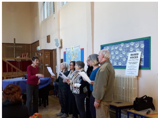
'Raised Voices' performing at our Autumn Seminar

Lively discussion took place and each group came up with suggestions of actions that can be taken at different levels; as individuals, via grassroots organisations, and working with national governments as well as international organisations. (We are planning to summarise these points and to circulate the summary amongst participants.)