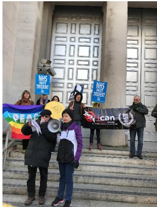
'No safe hands for unsafe weapons' demo

After a mock Nobel Peace Prize ceremony, Sheila reminded us the importance that civil society long-term advocacy has had on this achievement. She also spoke about the importance that such a treaty has on women's lives. Women have 50% higher risk of developing cancer resulting from ionizing radiation, which is constantly overlooked as a gendered consequence of nuclear violence. The final version of the treaty recognizes the importance of women's equal participation in a disarmament process for achieving a sustainable peace. The inclusion of these points reflects WILPF's strong advocacy during the negotiations and must be a reason for us all to celebrate.