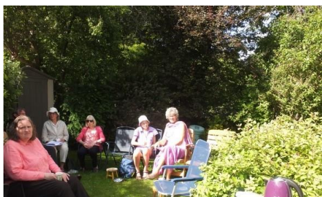
WILPF Sheffield's Garden Party