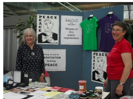
WILPF women in Norwich (photo credit: Claire Collen) [both photos]