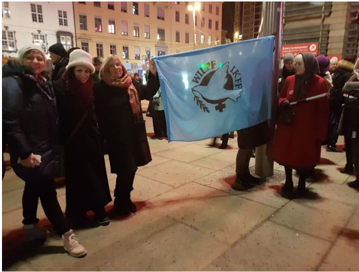
WILPF women at Nobel Peace Prize celebrations in Oslo, December

the team had been in personal contact with, including by phone or email, were present. When the numbers of credentialed states had risen dramatically, my team were applauded in one of our morning meetings, which was very generous.