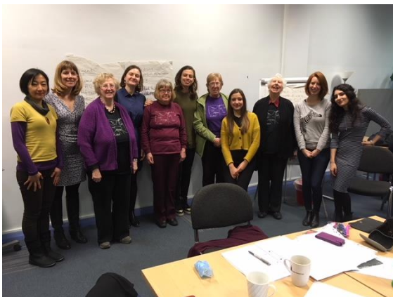
WILPF UK National Exec at our first meeting of January 2018