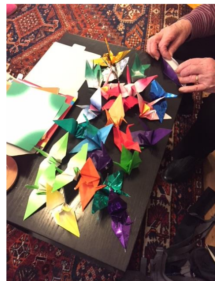
WILPF Orpington women making cranes

The ban was also the focus of the talk at our annual Garden Party. Orpington members also took part in the vigil outside the Law Courts about Alice Wheeldon, who was wrongly convicted a century ago of conspiring to murder Lloyd George.