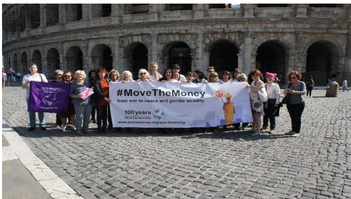
WILPF Europe meeting