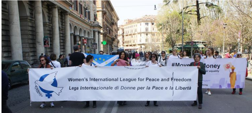
WILPF meeting in Rome 24 th - 26 th March

The EU is faced with an on-going militarisation through the implementation of the new EU “Global Strategy”, the outsourcing of the security business and border management to NATO. The increase in military budgets in the member states, the equipment with new generations of weapons, and a nuclear revival where the logic of deterrence is extremely dangerous.