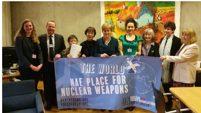
Hibakusha at the Scottish Parliament

They also travelled to Faslane and Coulport to witness first-hand the nuclear bases and the residents of Faslane Peace Camp. There was a moving exchange of information and memories as the visitors took tea beside the cherry tree planted by a previous Hibakusha visitor thirty years ago.