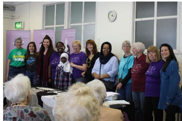
WILPF UK National Exec for 2017 – 2018 at our 2017 AGM