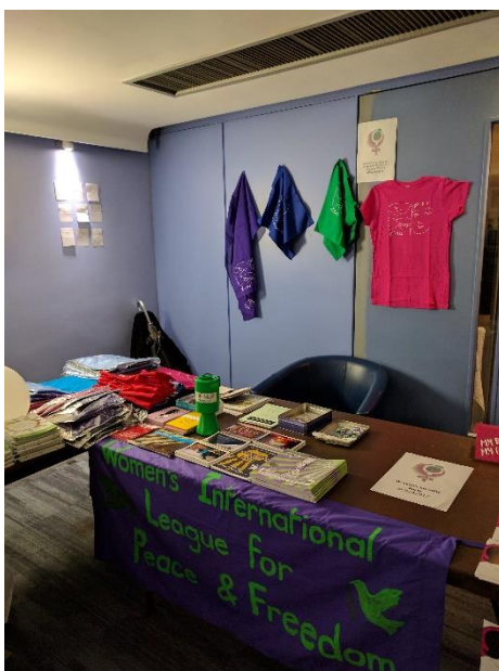
Our stall at Feminism in London, October