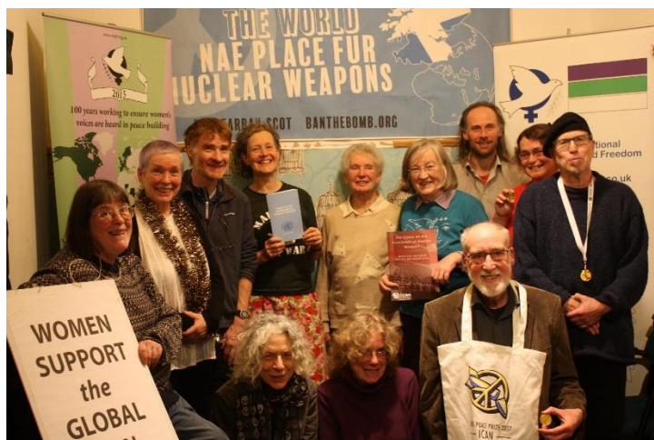
Scottish Branch WILPF Peace is the Prize' party, 11 th December

and shared internationally through the Scrap Trident Facebook page. WILPF members were well represented at several of the celebrations, including, but not exclusively, the opening party at UN House in Edinburgh.