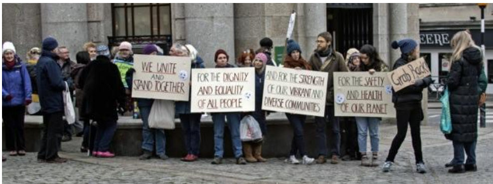
WILPF Cornwall 21 st January

July 11 th , we showed the fifth film of the series Women, War and Peace 'The War we are Living' – followed by an informative session hosted by member Lucia about the current situation for Women in Colombia. Our branch made a donation towards WILPF Colombia in support of the women coffee farmers in Cauca. September 2 nd , we held a demo "No to the Arms trade" – in solidarity with the week of action in London.