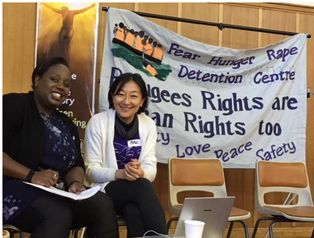
Our IB representatives

lobby at Westminster 8 th March 2018, and to contact our MPs to tell them what is happening to people who have come to UK to seek sanctuary.