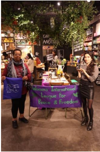
WILPF London members at our Lush stand

able to fundraise. 100% of proceeds from Lush's Charity Pot were donated to WILPF and by the end of the weekend we had raised over £1000!