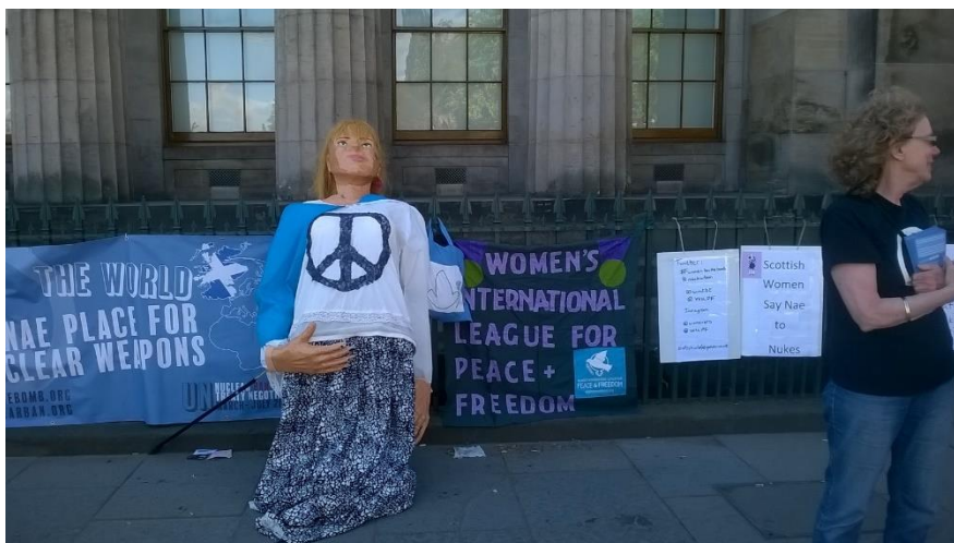
Women's Day of Action June 17 th, Support the Global Ban Edinburgh

WILPF has been engaged in demonstrations, collecting food, sleeping-bags and clothing to support refugees in Calais, and held stalls to talk to the public about these issues. We have made banners, talked about refugees and our government's inaction at meetings and written to MP's, ministers and the PM.