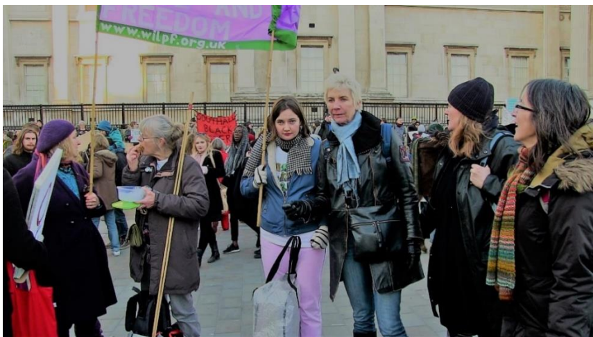
WILPF Members at the Rally in Trafalgar Square, 21st January