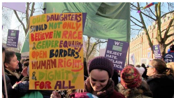
WILPF London women at the Women's Marches

January , on 21 st we went to the Amazing March and Demonstration, and on the 29 th held a Connect Day welcoming new members. February , on 8 th and 9 th we went to a Wonderful event at Tobacco Dock where Lush hosted all the charities and organisations they support – including UK WILPF.